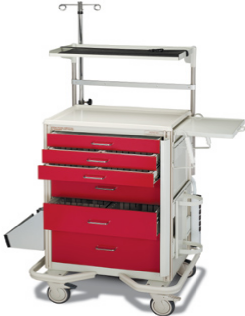
Model PAPE-1 (pictured)